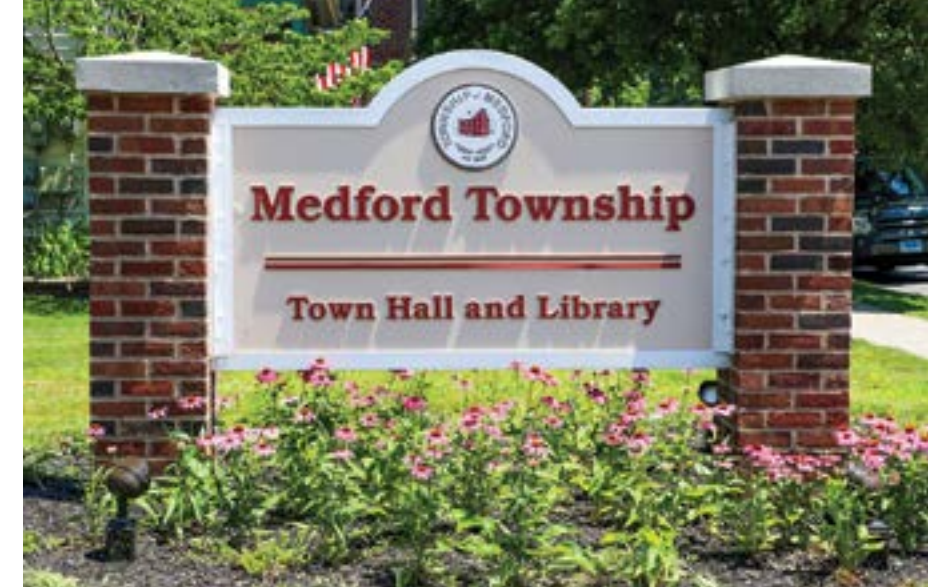
An EASY-TO-READ SIGN along Union Street marks the entrance to the Pinelands Library located in the newly constructed Medford Township Town Hall.

“Customers...were excited to find the same warm inviting ambience and strong sense of community...plus a new layout just right for reading and relaxing.”