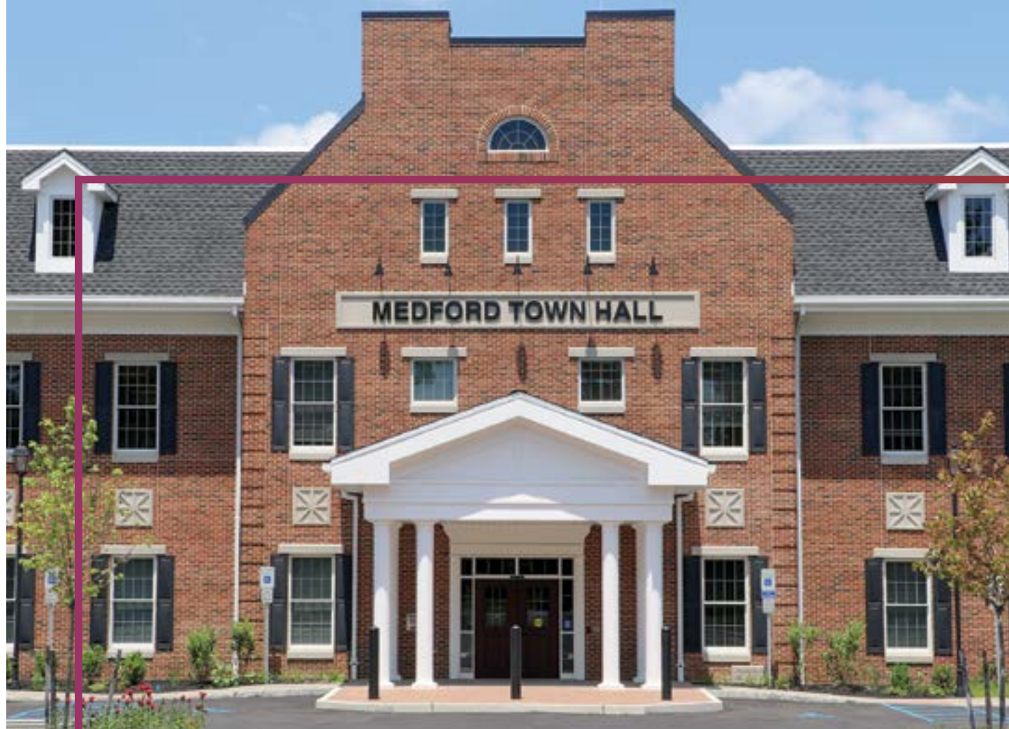
After much anticipation, staff at Pinelands Library welcomed customers to a bright NEW FACILITY which houses an upgraded technology center, work spaces, plenty of on-site parking and more.