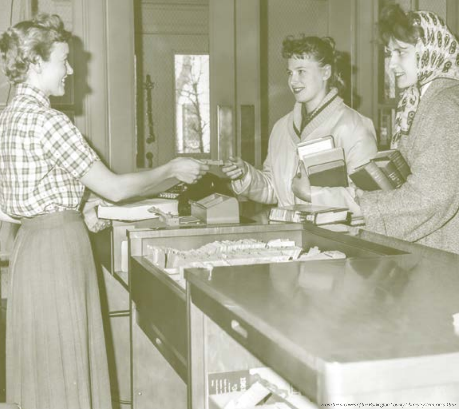
From the archives of the Burlington County Library System, circa 1957