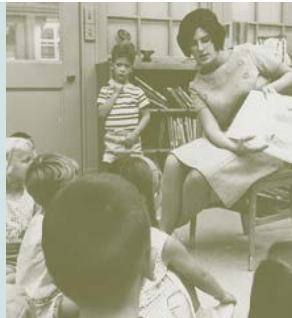
From the archives of the Burlington County Library System, circa 1962.