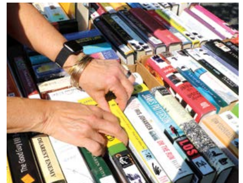
Friends of the Burlington County Library, Inc., raised funds by holding warm-weather OUTDOOR BOOK SALES in Westampton.