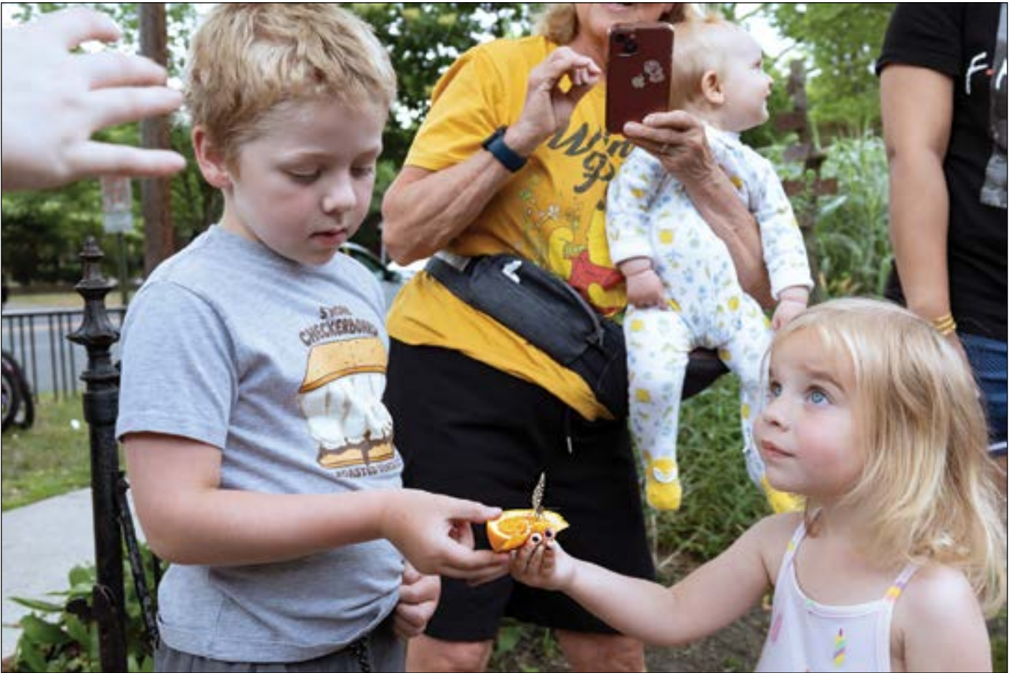
Families gathered at Riverton Library for a hands-on butterfly release.