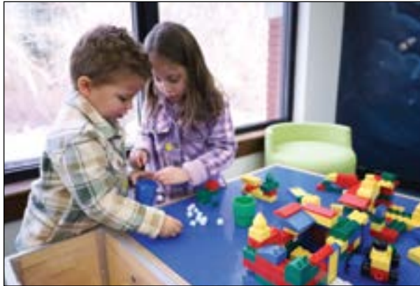
Cozy, comfortable and fun new furniture in the children's department offers unique and imaginative places to hang out and play while visiting the Pemberton Library.

THE PEMBERTON LIBRARY'S children's department saw sweeping design changes and upgrades that made the branch a destination within the community! Renovations were completed to the library's children's room, including a colorful paint scheme that coordinates with pleasing new decorative elements, carpeting, shelving and seating. In addition, a new LEGO Discovery Table that keeps little ones busy and engaged, as well as other play equipment have been installed. Youngsters are also encouraged to nestle into cozy reading nooks while their parents mingle and network with other parents in spaces designed for lounging. The roughly $200,000 in improvements were financed through Special Purpose Funding included in the FY2023 state budget.