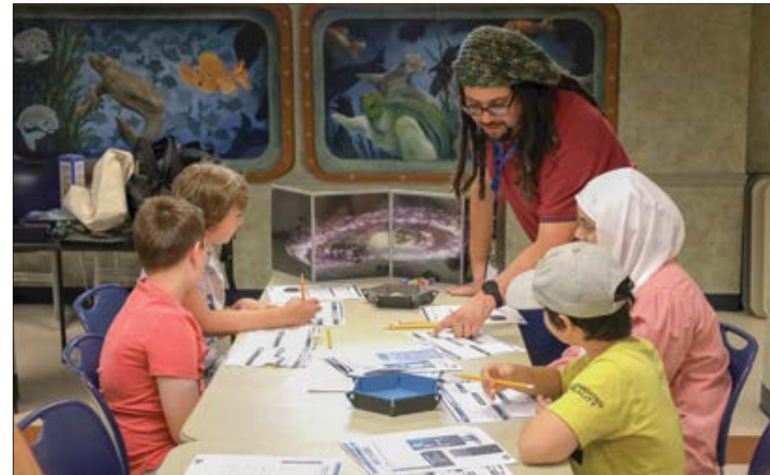
Bordentown Library hosts table gaming nights for kids and teens for evenings filled with unplugged fun.