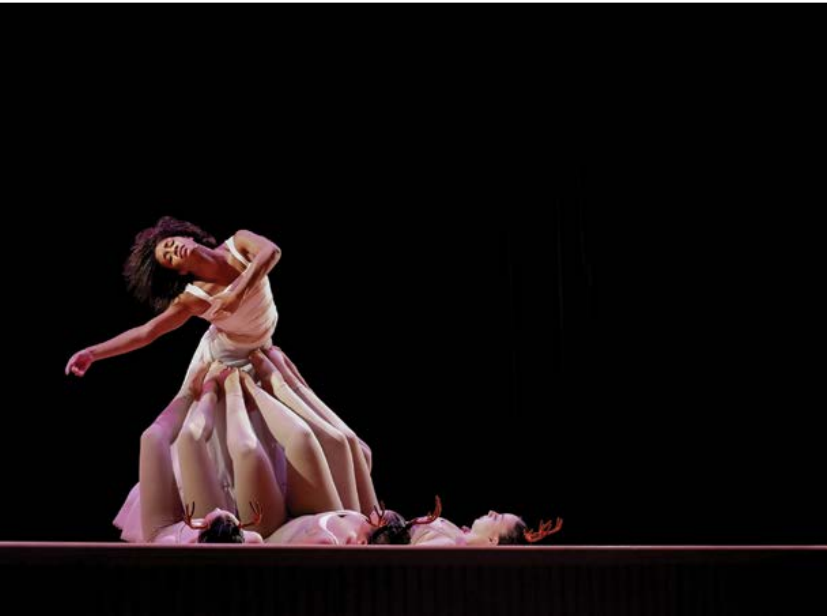
On the cover and above: Performances by Roxey Ballet thrilled audiences at Burlington County Library in Westampton. From several other thematic pieces, the first performance featured work choreographed for dancers with physical disabilities.