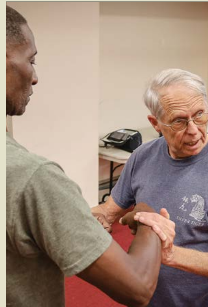
Cinnaminson Library presented a series of Tai Chi classes for adults. The Chinese martial art involves gentle movement, meditation and breathing.