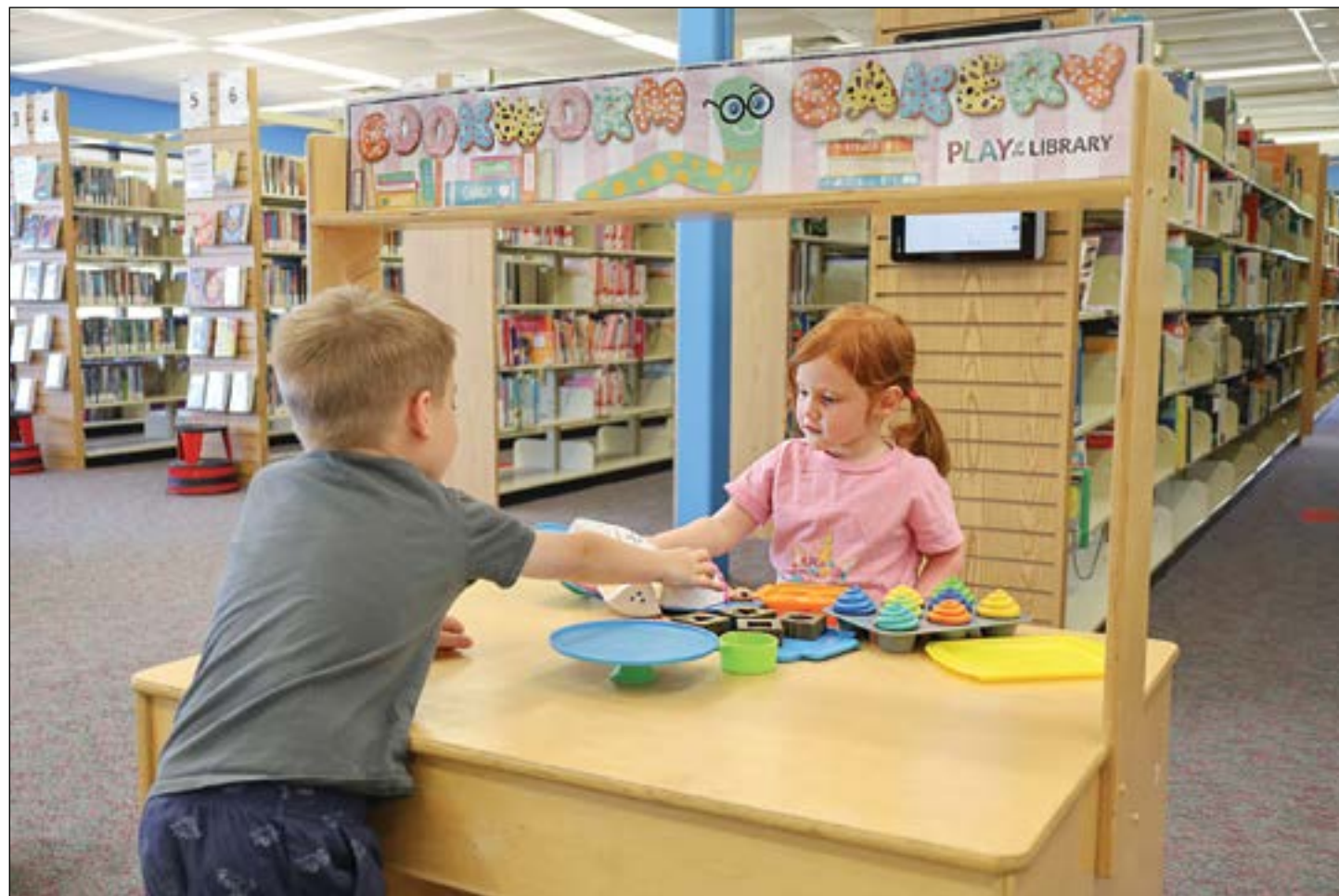
The "Bookworm Bakery" is just one playtime configuration in the Children's Services area at Burlington County Library . The themed experiences rotate so kids can also enjoy some make believe with our "Snail Mail" post office toys, a "Fresh Finds" grocery store, an exciting "Jungle Adventure" setup and more.